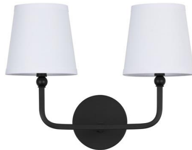
Powder Room Light (if applicable per plan)