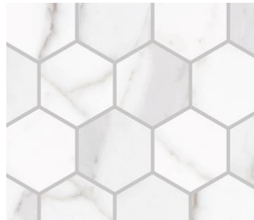
Shower Floor Tile: Cortina Juno White Hexagon Mosaic