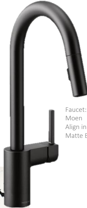
Faucet: Moen Align in Matte Black