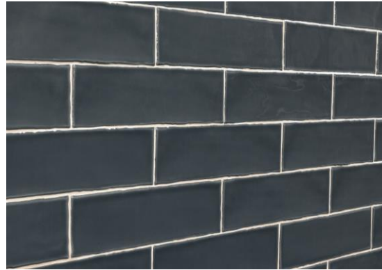
Shower Walls: 3x12 Ripple Dark Gray