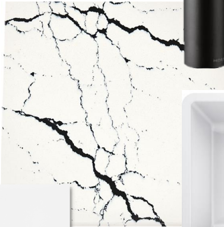
Countertops: Silestone Miami White (Perimeter) and Cambria Hemsworth (Island)