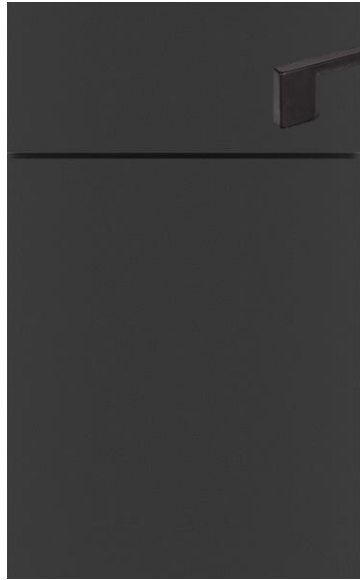
Cabinet Hardware: Sutton Pull in Matte Black