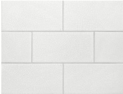
Backsplash: Emma White – 3x6