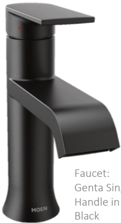
Faucet: Genta Single Handle in Matte Black