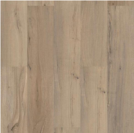
Shaw Luxury Vinyl Plank Polaris Plus – Driftwood