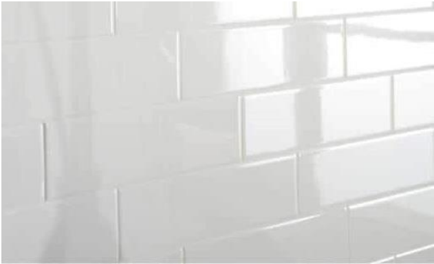
Tub/Shower Walls: 3x12 Catch Ice Subway Tile