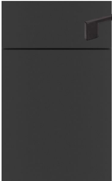
Cabinet Hardware: Sutton Pull in Matte Black