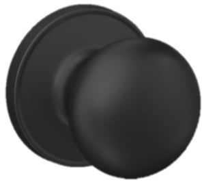
Stratus Knob in Matte Black