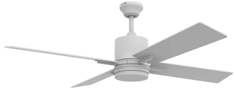
Bedroom(s) Light/Fan (per plan)