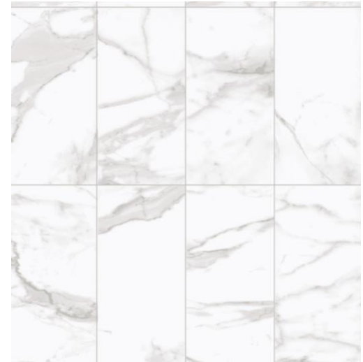
Floor Tile: Cortina Juno White – 12x24