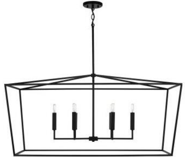
Dining Room Light (if applicable per plan)