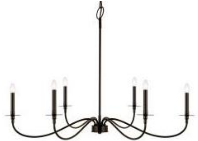
Family Room Light