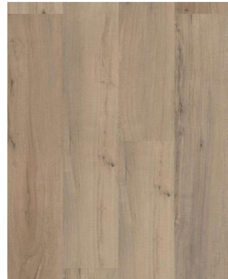
Shaw Luxury Vinyl Plank Polaris Plus – Driftwood