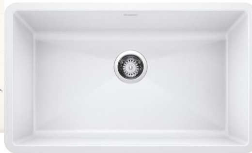
Sink: Blanco Precis in White