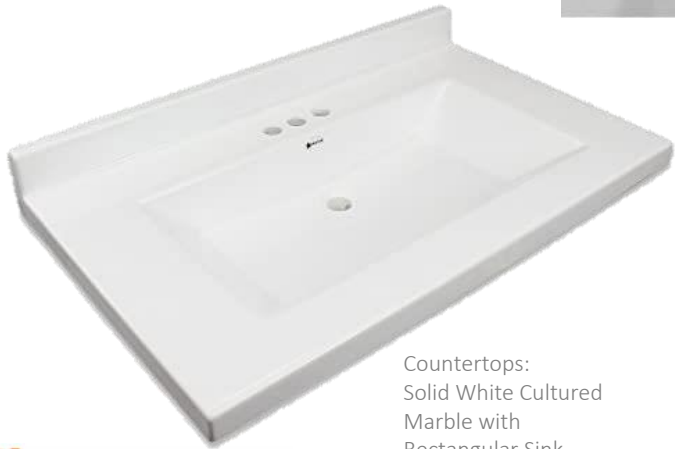
Countertops: Solid White Cultured Marble with Rectangular Sink