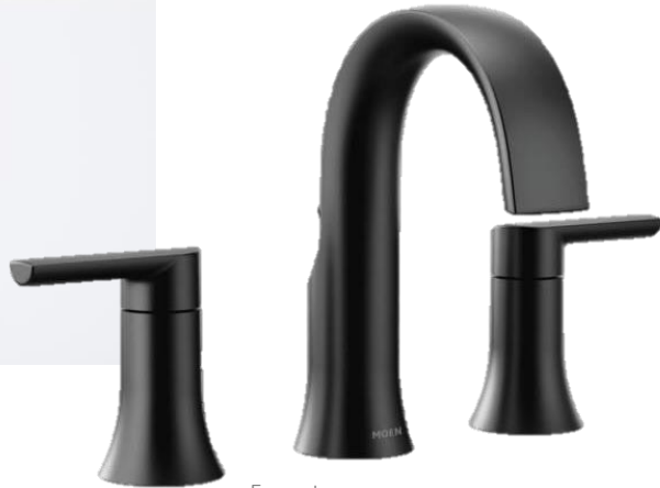
Faucets: Doux 8" Spread in Matte Black