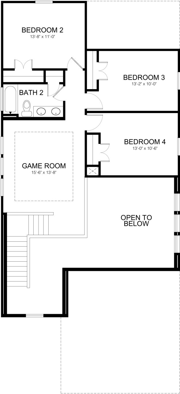
SECOND FLOOR PLAN ELEVATION A