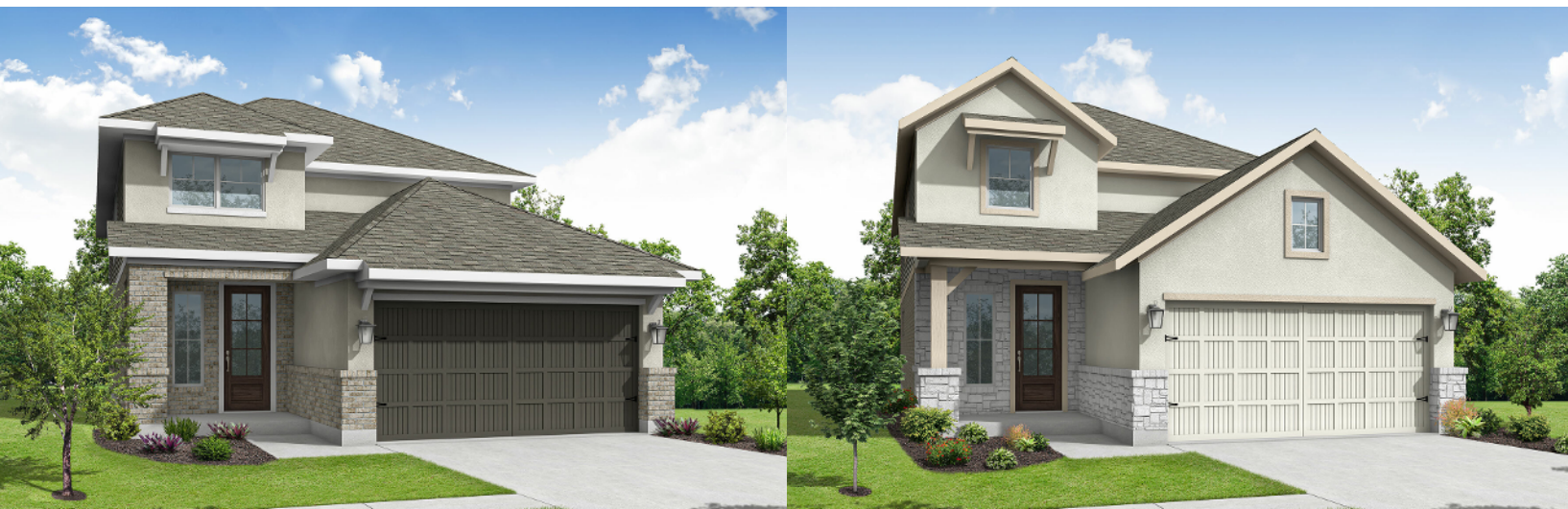
ELEVATION B - 2173 SQ.FT.