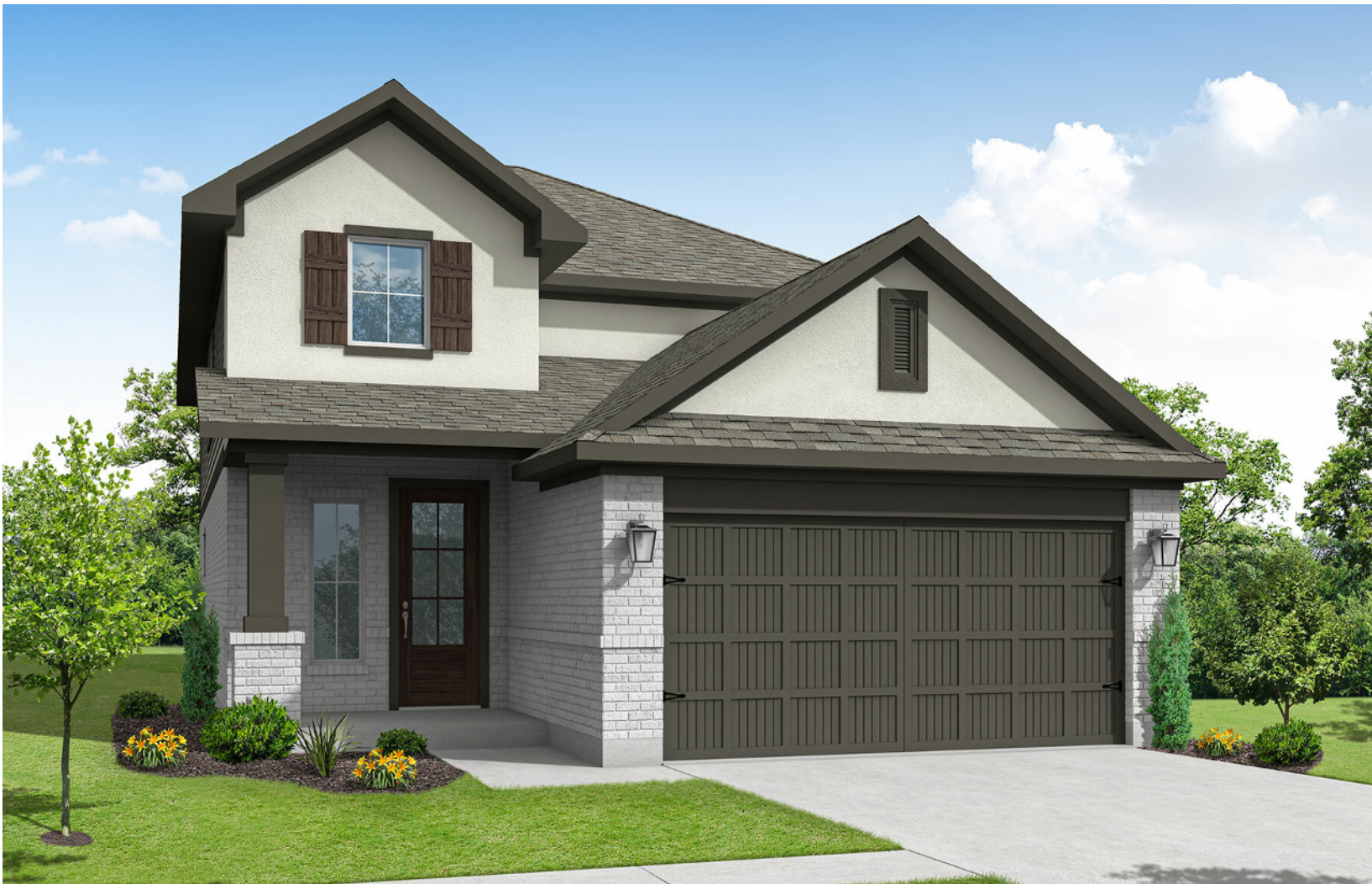
ELEVATION A - 2173 SQ.FT.