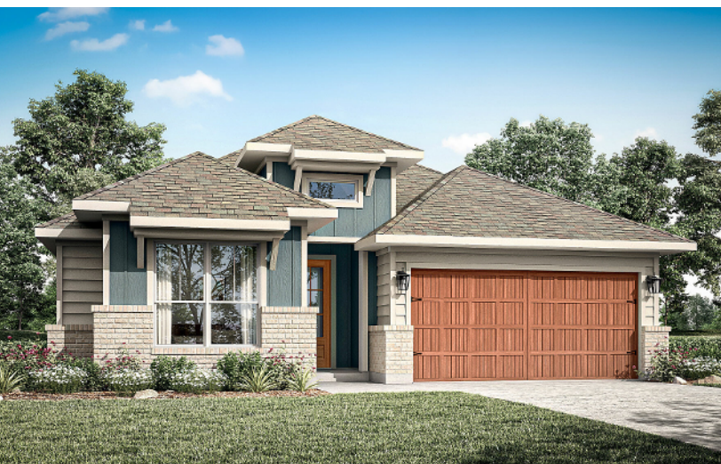
ELEVATION H - 1905 SQ.FT.