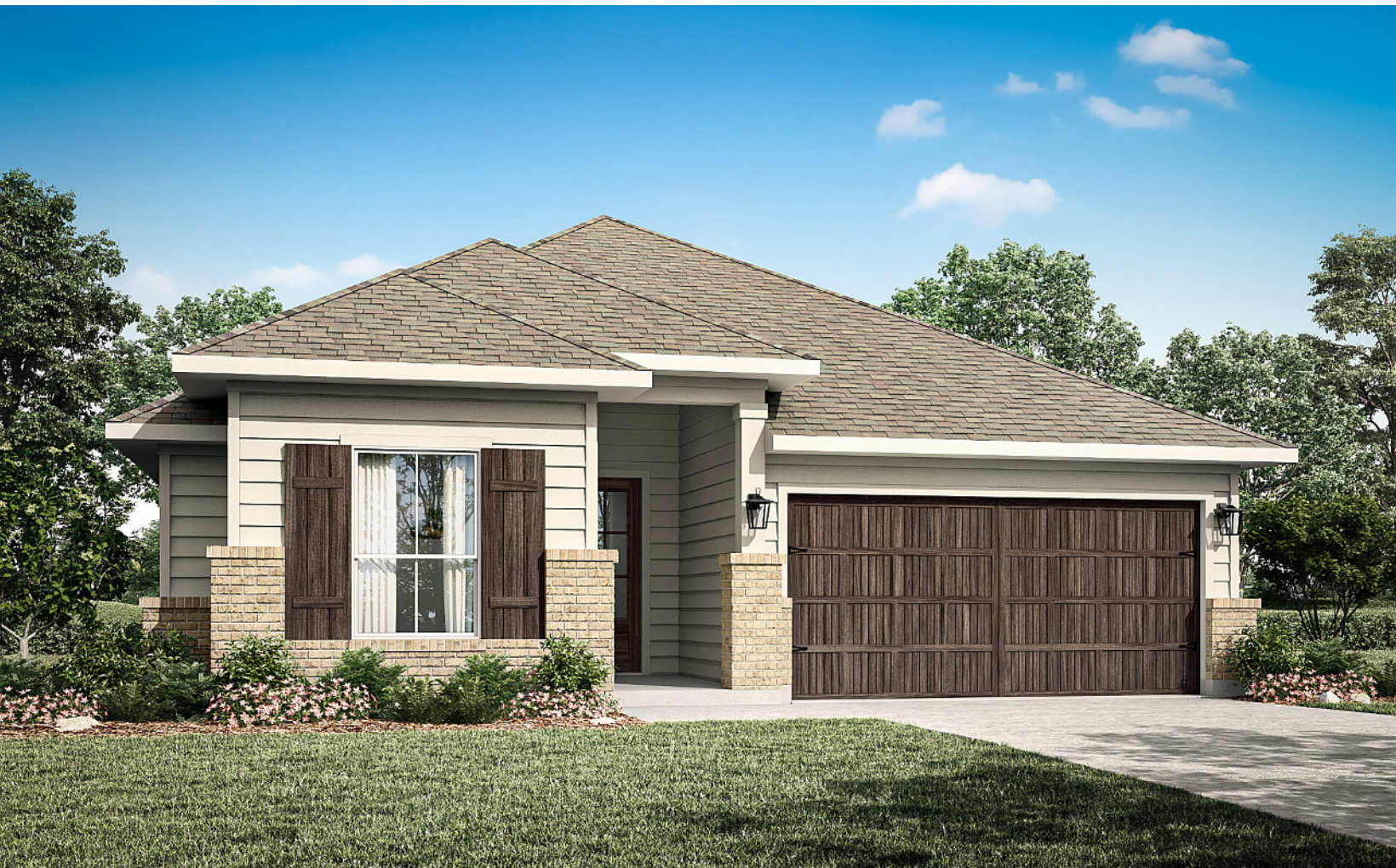
ELEVATION G - 1911 SQ.FT.