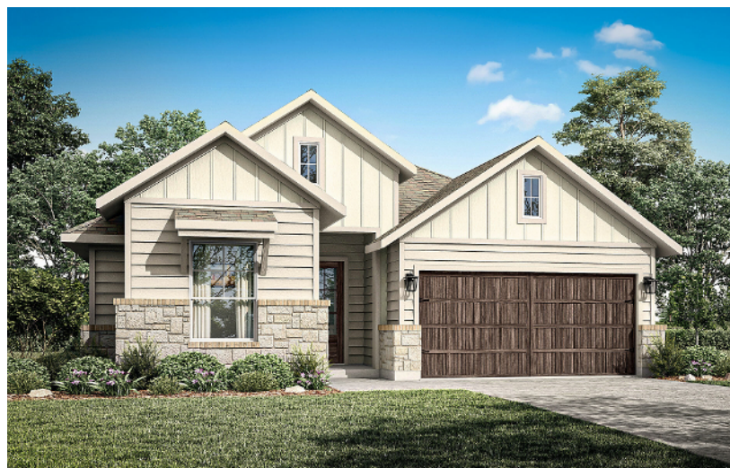
ELEVATION I - 1905 SQ.FT.