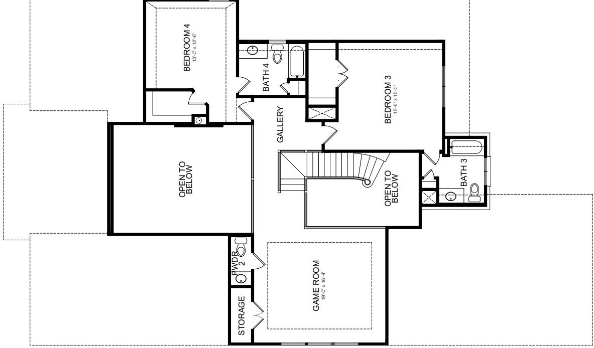
SECOND FLOOR PLAN ELEVATION A

ELEVATION A - 3,915 SQ.FT. ELEVATION B - 3,904 SQ.FT. ELEVATION C - 3,633 SQ.FT.