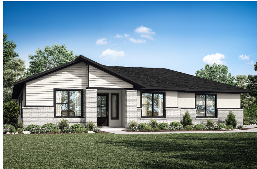
ELEVATION C - 2092 SQ.FT.