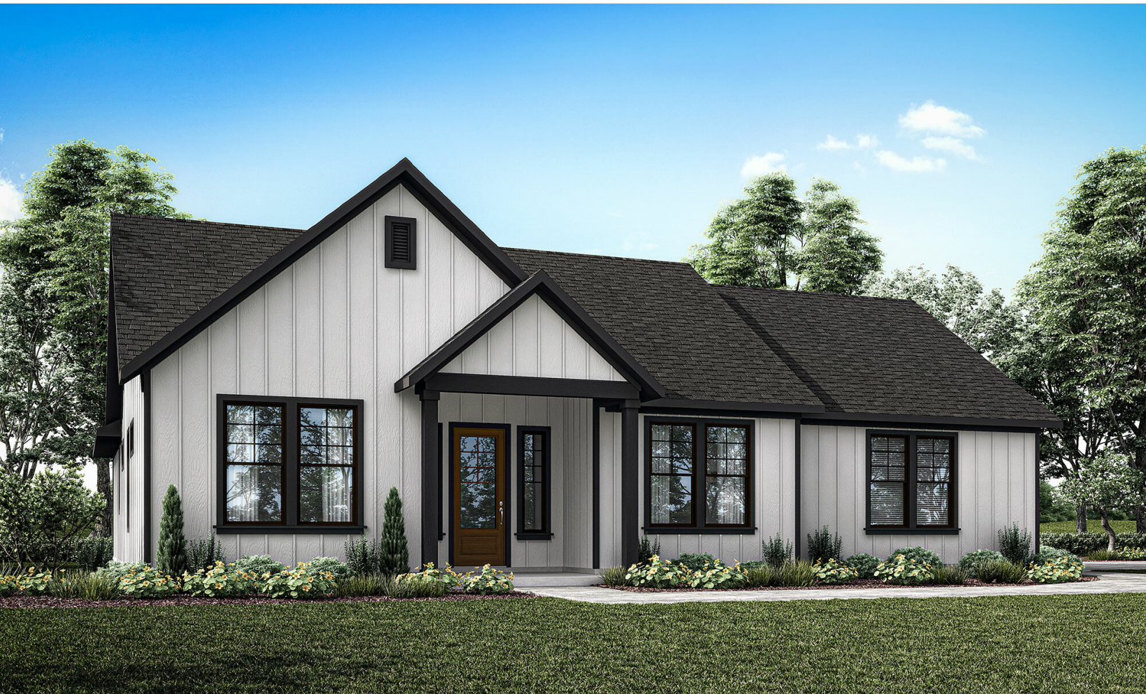
ELEVATION A - 2067 SQ.FT.