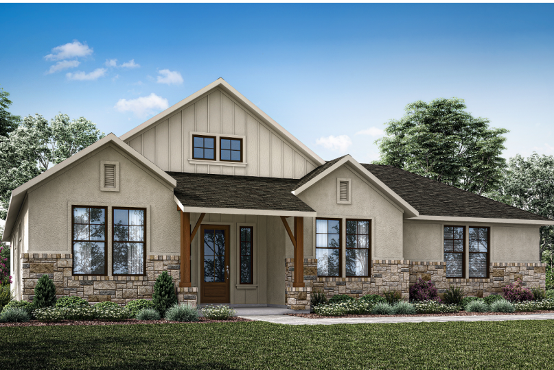
ELEVATION B - 2084 SQ.FT.