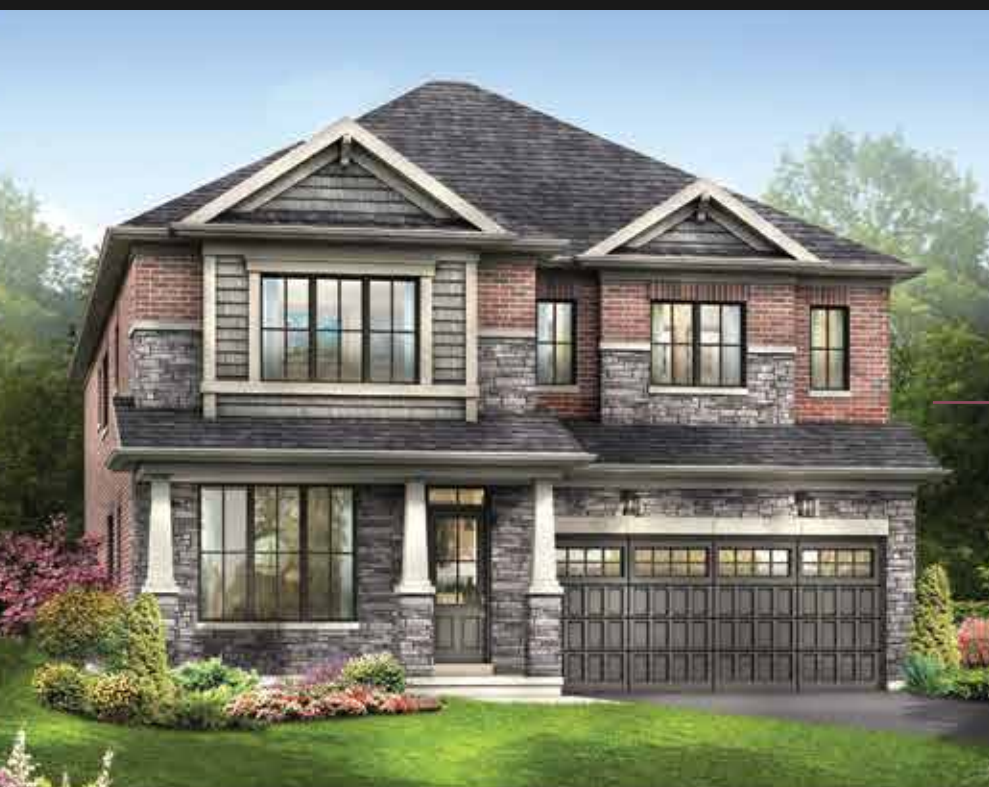
STYLE C - 3089 SQ.FT.