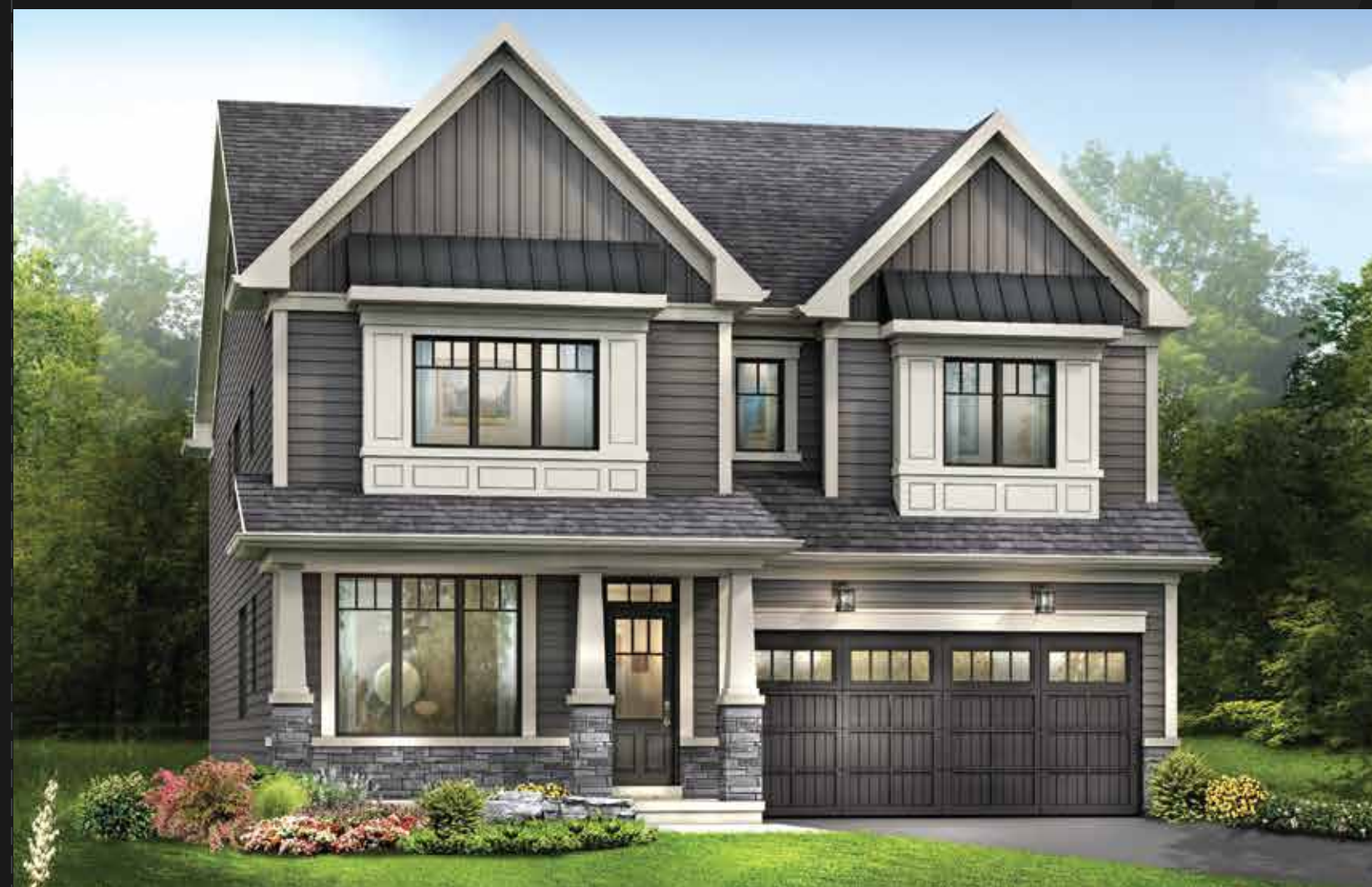
STYLE A - 3104 SQ.FT.