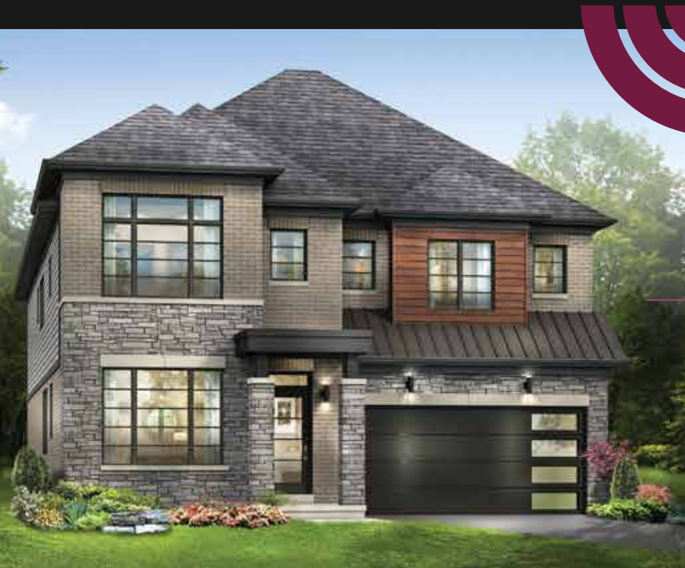
STYLE B - 3112 SQ.FT.