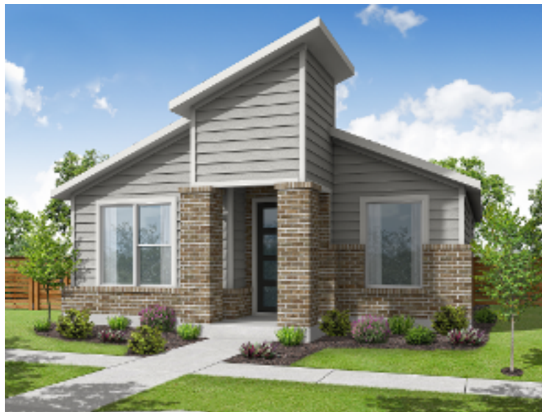
ELEVATION B - 1264 SQ.FT.