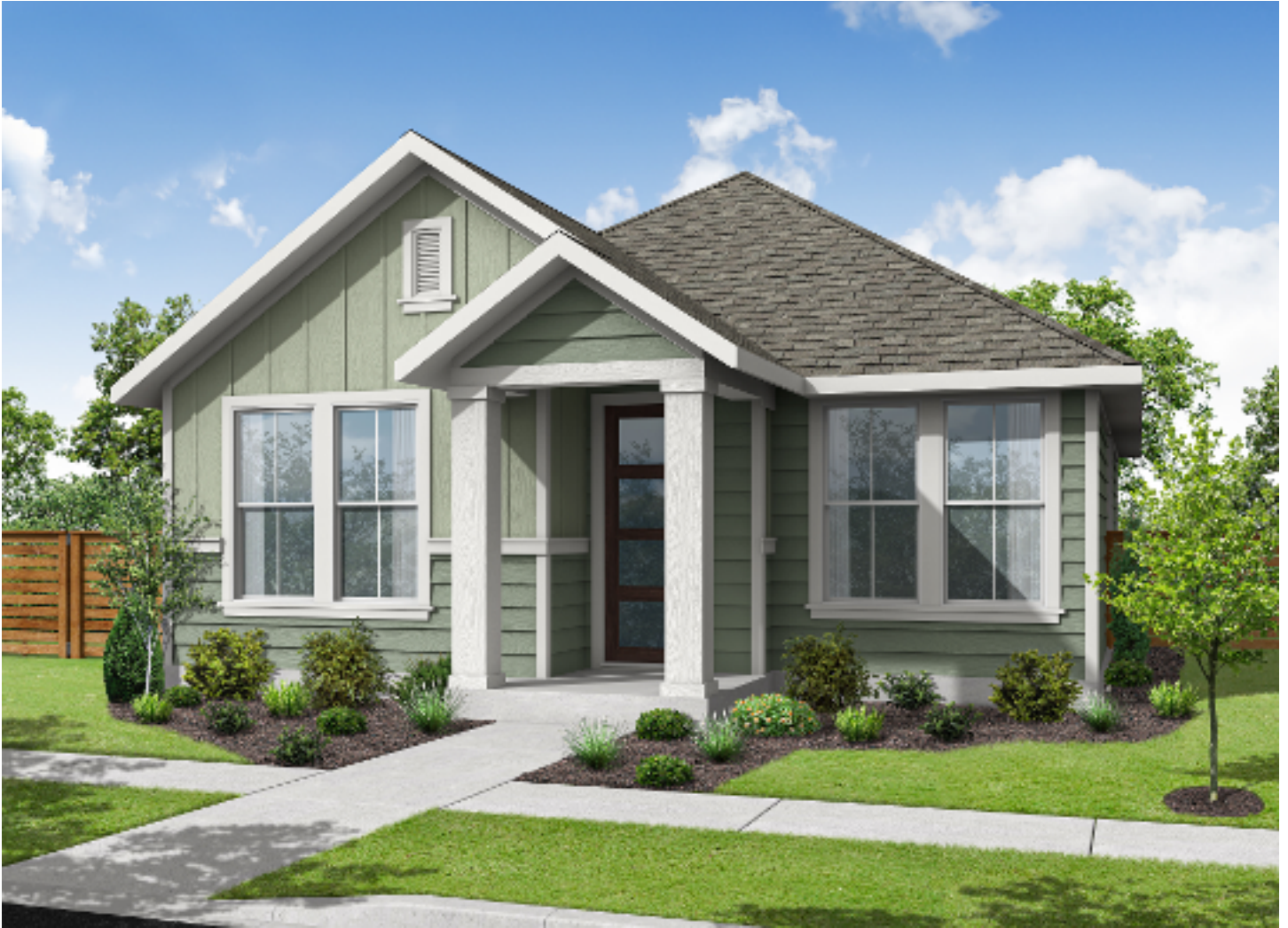
ELEVATION A - 1247 SQ.FT.