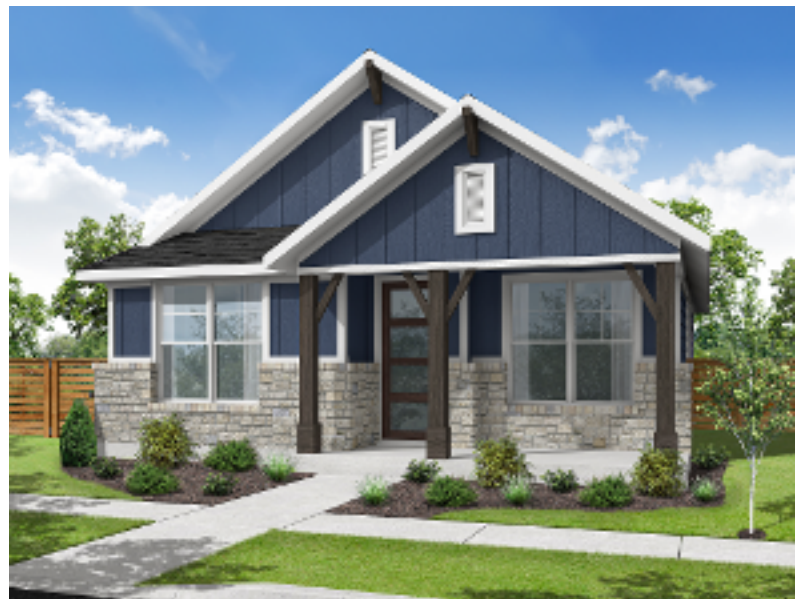
ELEVATION C - 1261 SQ.FT.