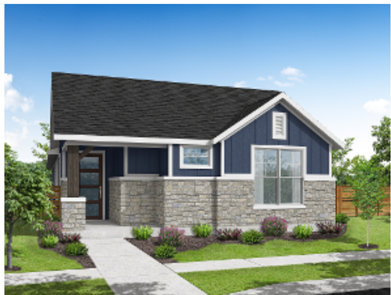
ELEVATION C - 1400 SQ.FT.