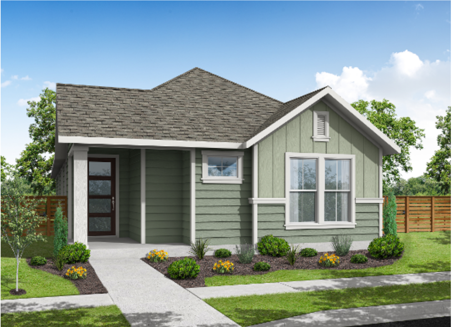
ELEVATION A - 1377 SQ.FT.