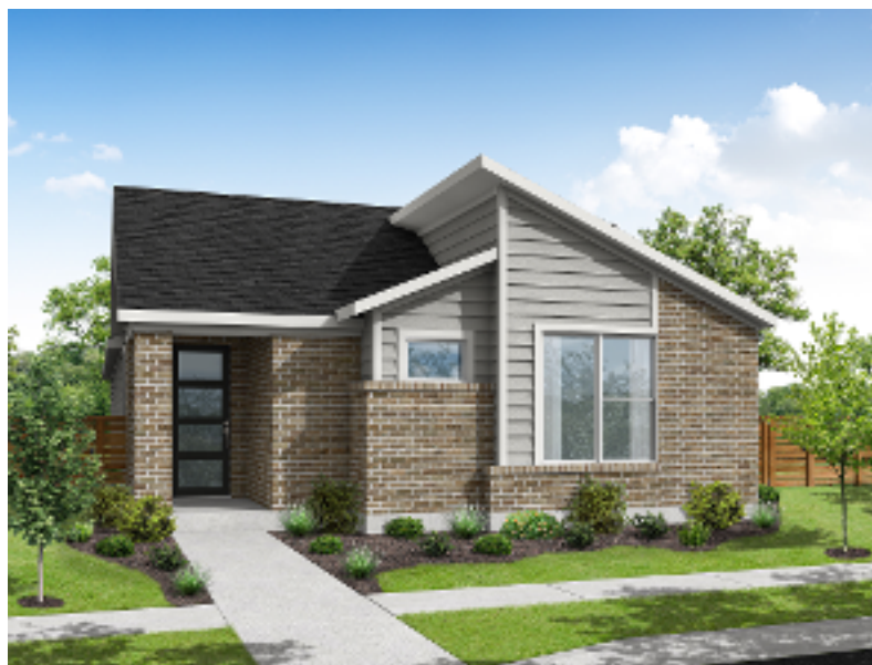
ELEVATION B - 1401 SQ.FT.