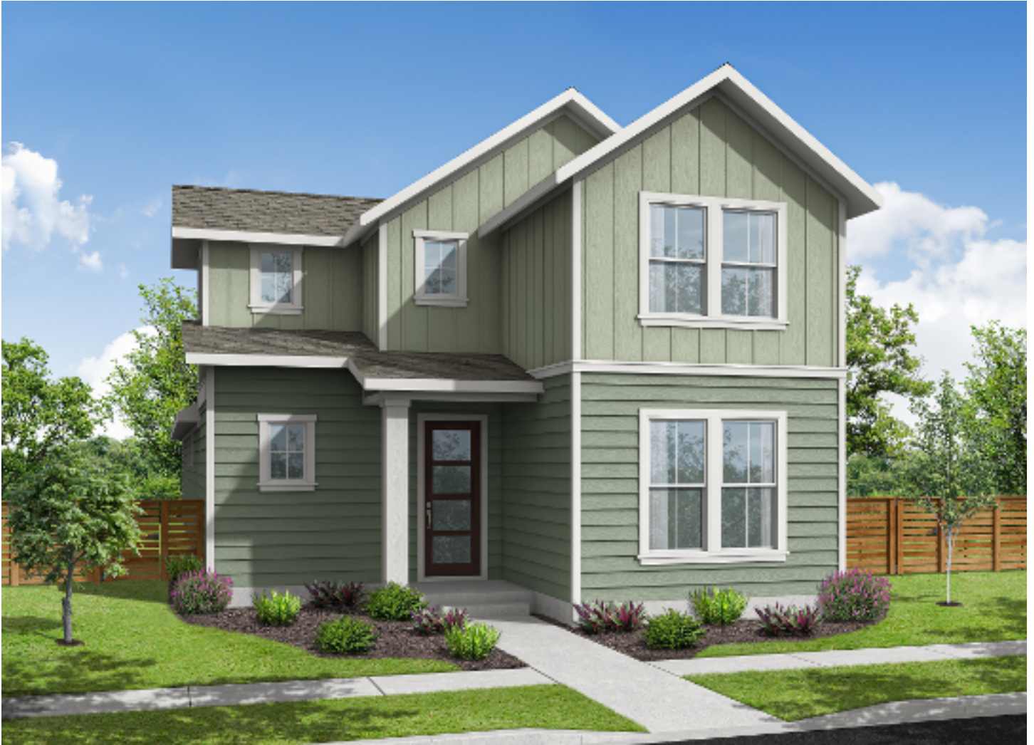
ELEVATION A - 1670 SQ.FT.