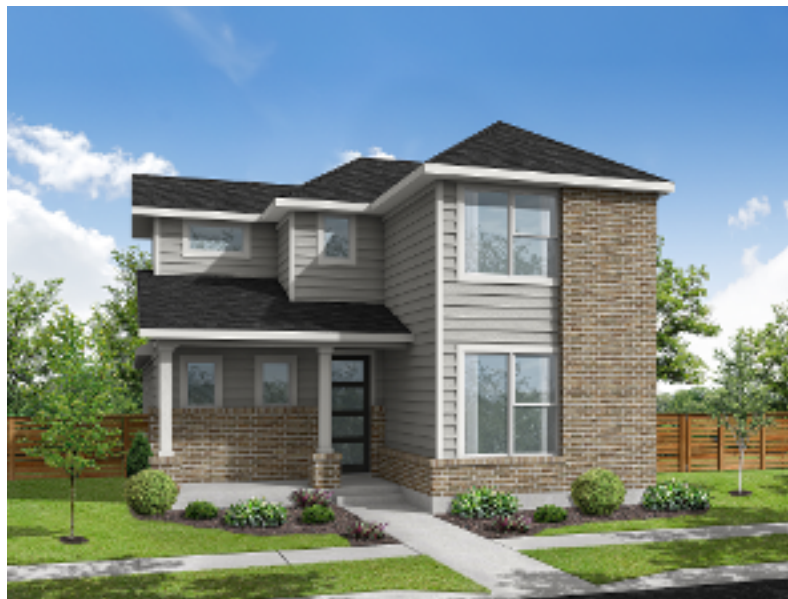
ELEVATION B - 1691 SQ.FT.