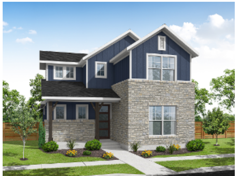
ELEVATION C - 1691 SQ.FT.